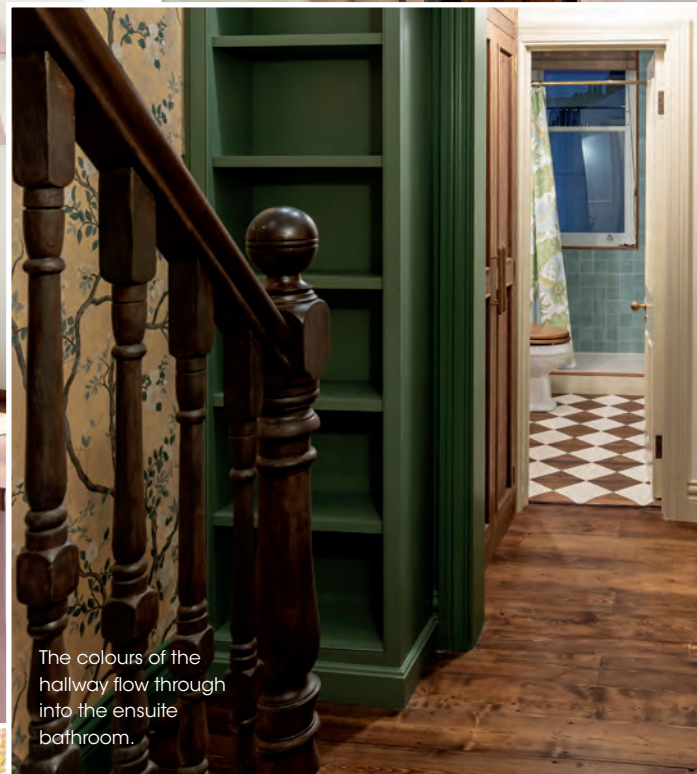
The colours of the hallway flow through into the ensuite bathroom.