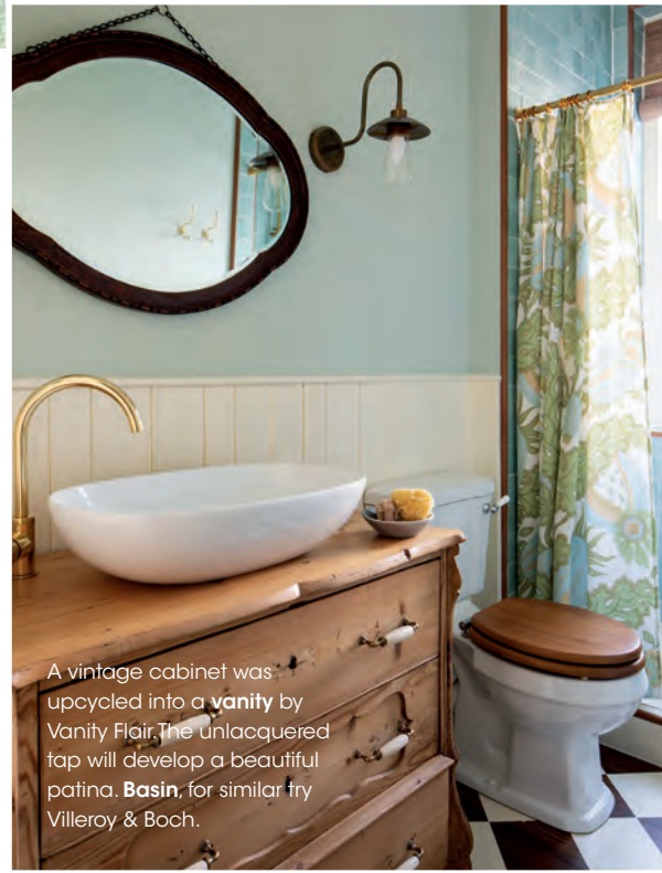
A vintage cabinet was upcycled into a vanity by Vanity Flair. The unlacquered tap will develop a beautiful patina. Basin , for similar try Villeroy & Boch.