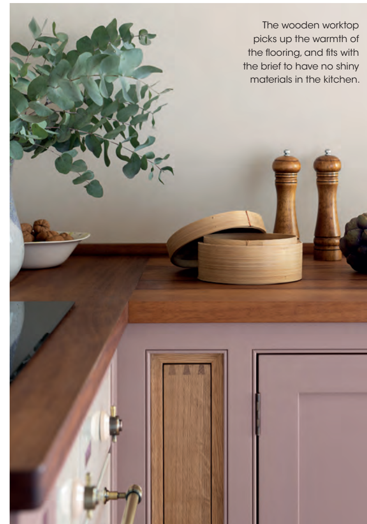
The wooden worktop picks up the warmth of the flooring, and fits with the brief to have no shiny materials in the kitchen.