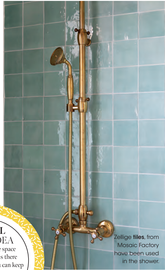
Zellige tiles, from Mosaic Factory have been used in the shower.

SMALL SPACE IDEA If you don't have space in your kitchen, is there somewhere else you can keep your washing machine and tumble dryer? Just ensure it's safe to do so.