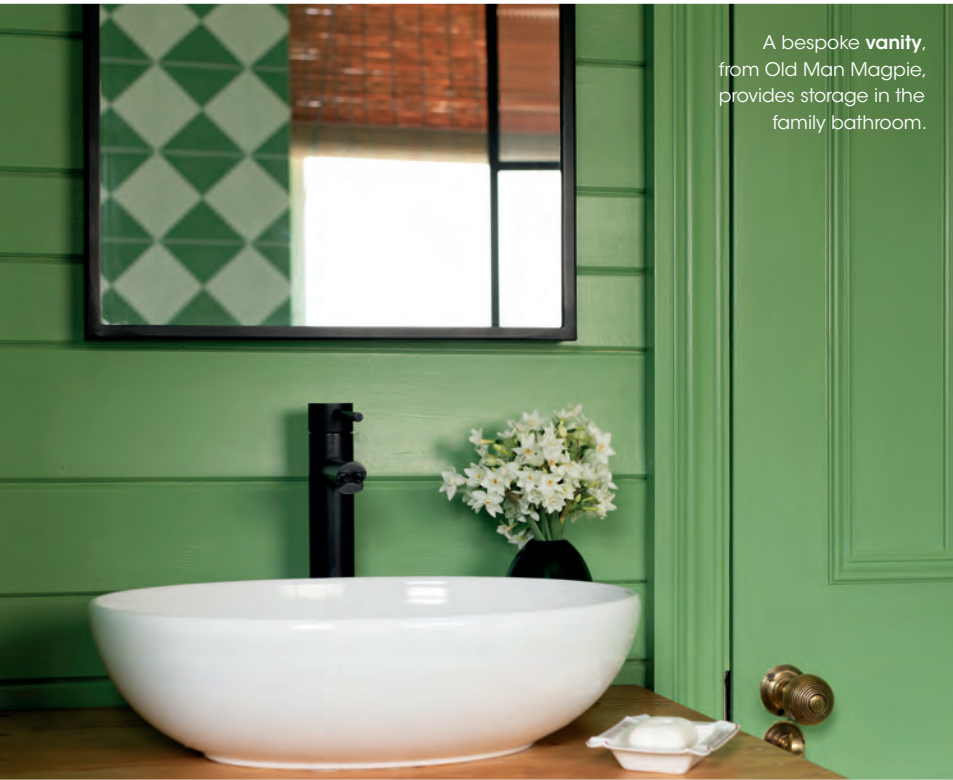
A bespoke vanity, from Old Man Magpie, provides storage in the family bathroom.