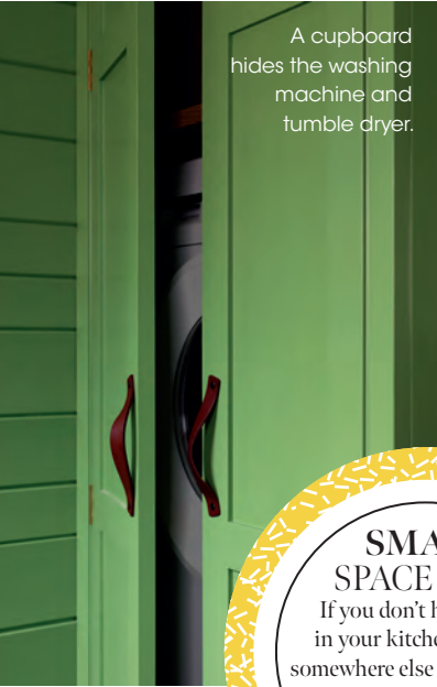
A cupboard hides the washing machine and tumble dryer.

SMALL SPACE IDEA If you don't have space in your kitchen, is there somewhere else you can keep your washing machine and tumble dryer? Just ensure it's safe to do so.