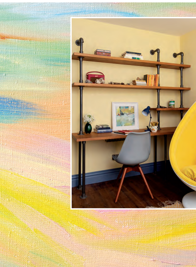
For the owner's 10-year-old son, Brooke created a modern room featuring a scaffold bookshelf and a bright yellow egg pod chair, for similar, try Nordic Haus.