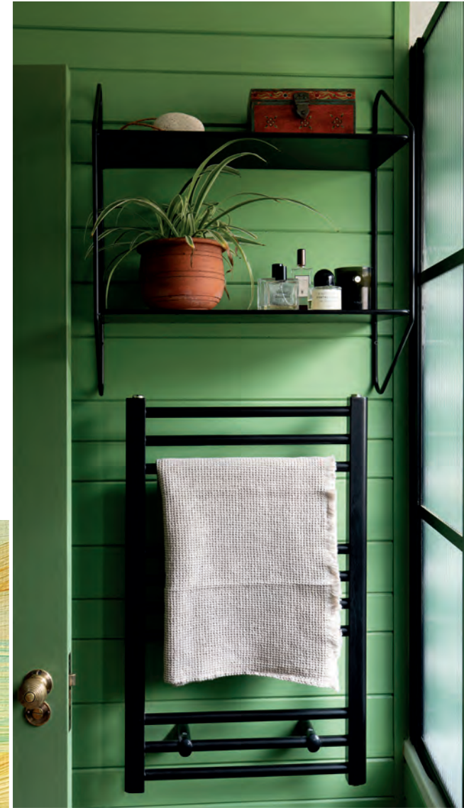
below Black elements give the family bathroom a cool edge. Shelf , for similar, try String Furniture; radiator , for similar, try Vogue UK.