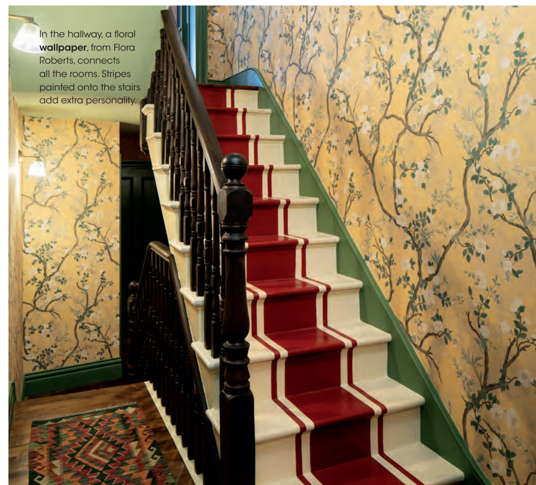
In the hallway, a floral wallpaper, from Flora Roberts, connects all the rooms. Stripes painted onto the stairs add extra personality.