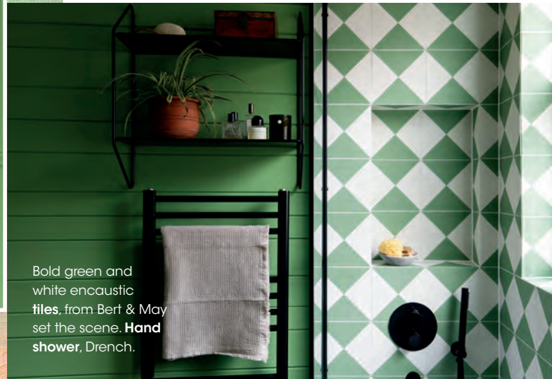
Bold green and white encaustic tiles, from Bert & May set the scene. Hand shower , Drench.