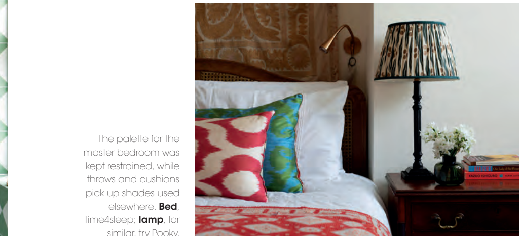
The palette for the master bedroom was kept restrained, while throws and cushions pick up shades used elsewhere. Bed , Time4sleep; lamp , for similar, try Pooky.