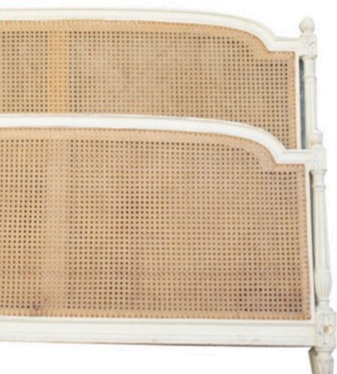
Wide Shabby Chic Cane Bed Frame £475