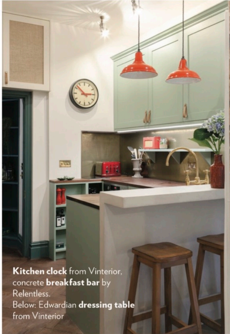
Kitchen clock from Vinterior, concrete breakfast bar by Relentless. Below: Edwardian dressing table from Vinterior