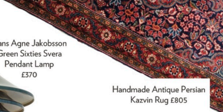
Handmade Antique Persian Kazvin Rug £805