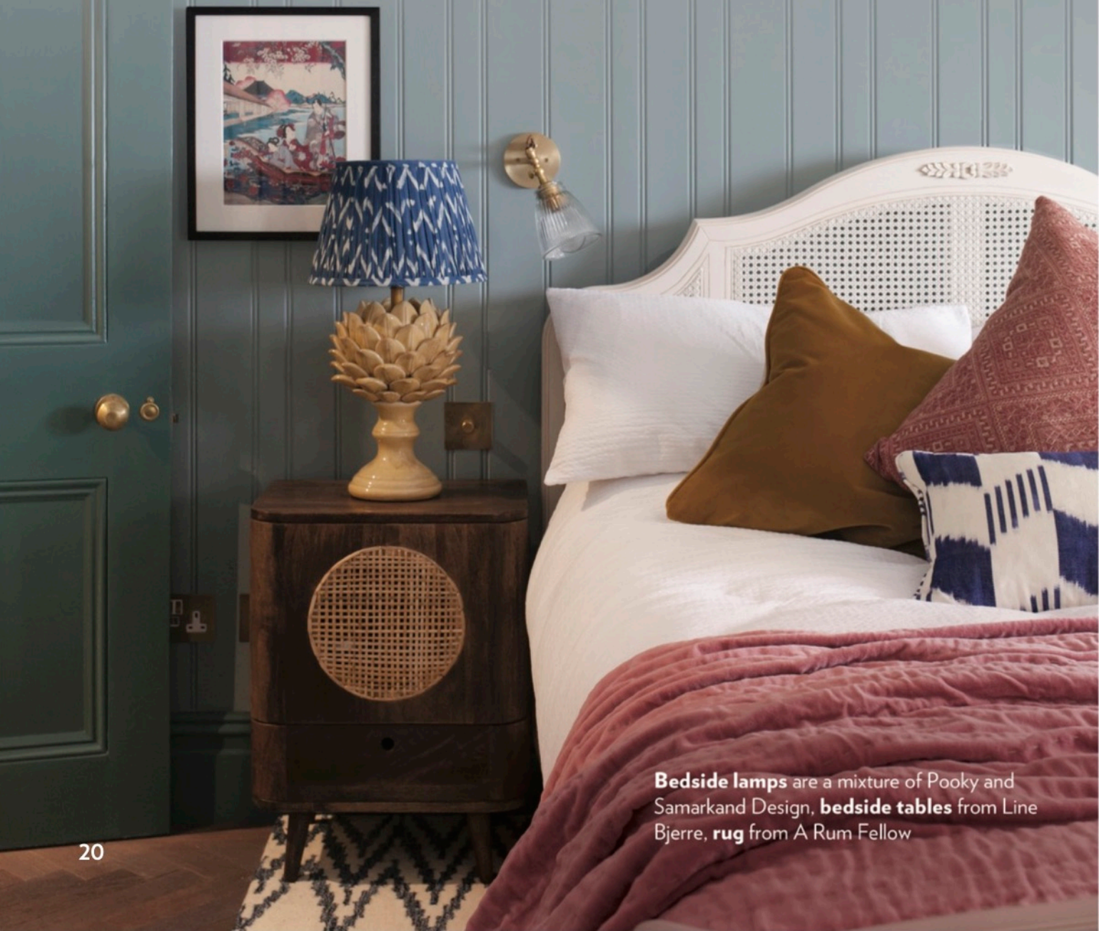
Bedside lamps are a mixture of Pooky and Samarkand Design, bedside tables from Line Bjerre, rug from A Rum Fellow

See more of Brooke Copp-Barton's work at home-interiordesign.co.uk