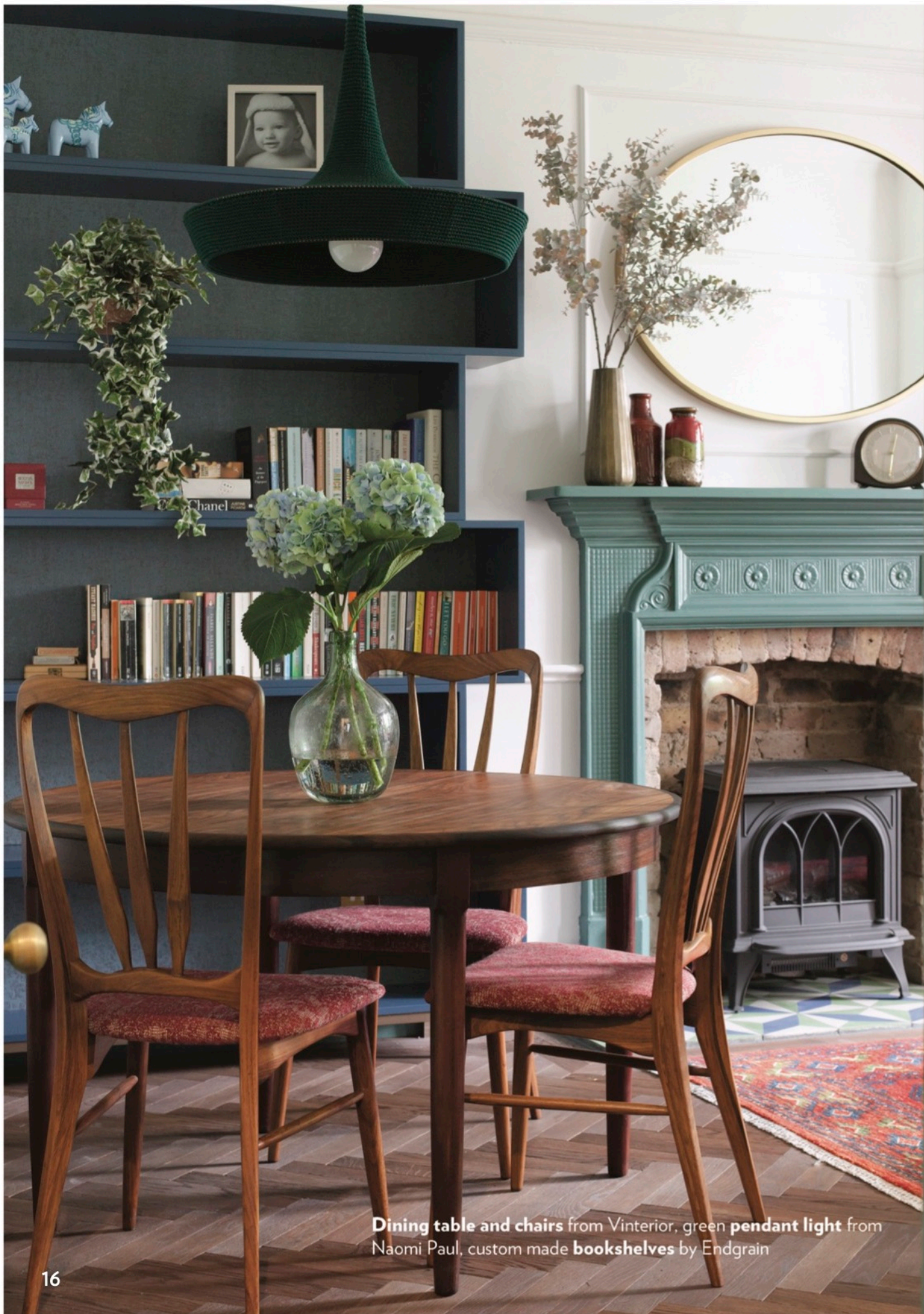
Dining table and chairs from Vinterior, green pendant light from Naomi Paul, custom made bookshelves by Endgrain