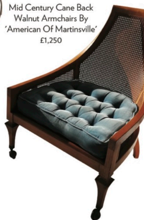
Mid Century Cane Back Walnut Armchairs By 'American Of Martinsville' £1,250